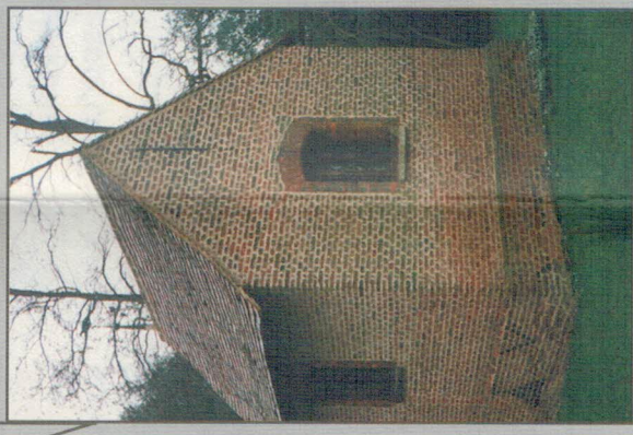
Gallows Conduit (and Ivy Conduit), George Road; listed buildings and scheduled ancient monuments.