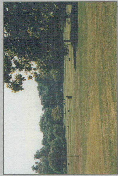
Coombe Wood Golf Course, the semi-rural setting of Coombe Wood Conservation Area.