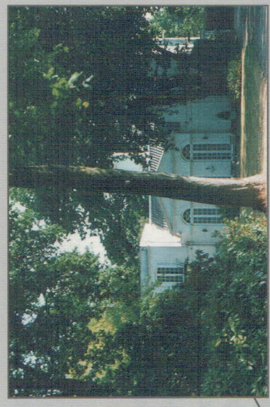
The Pavilion, Warren Road.