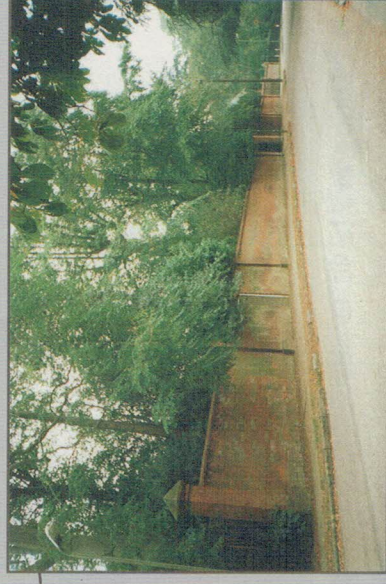
Boundary walls, wide roads and mature vegetation enclosing the large houses in the Conservation Area.