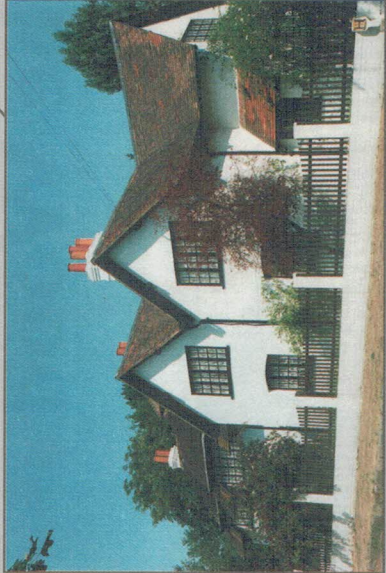
White Rose Cottage, George Road.

© Crown Copyright. All rights reserved (Royal Borough of Kingston upon Thames LA086479 2001)