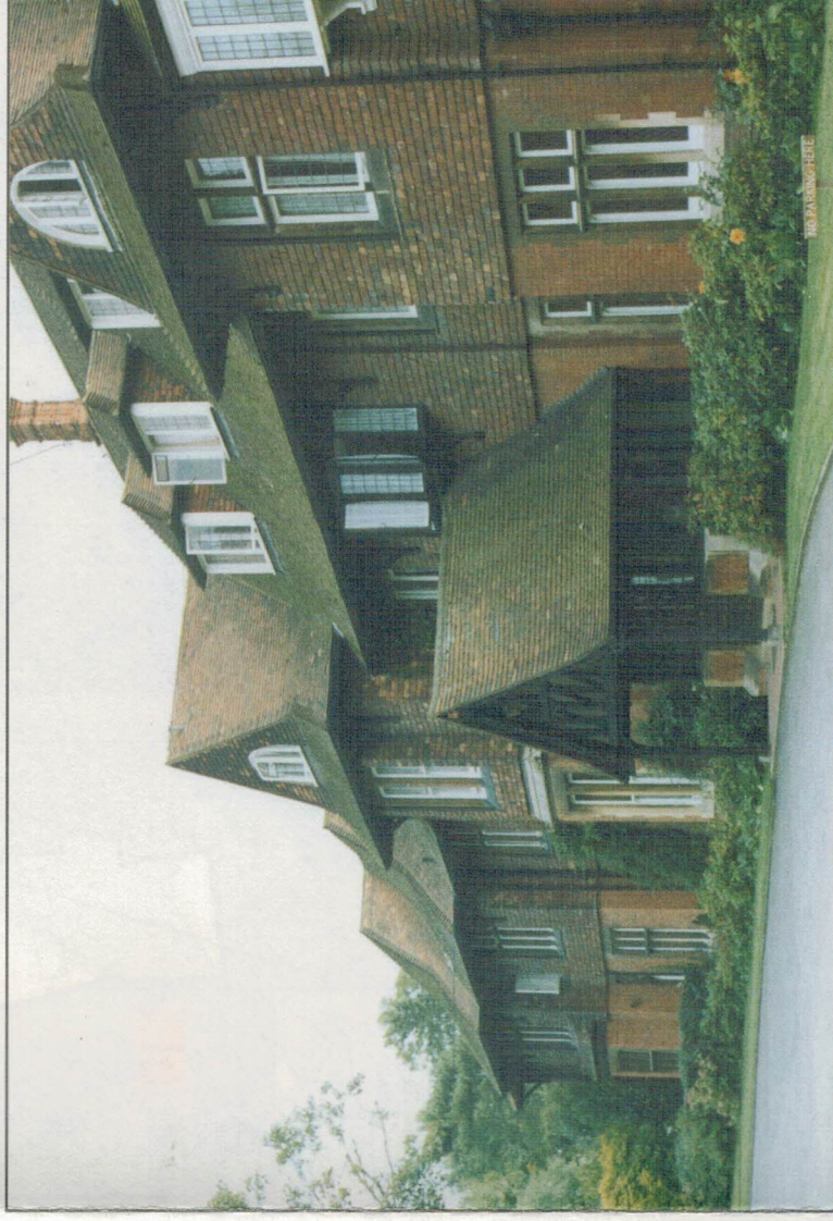
Marymount International School, George Road.