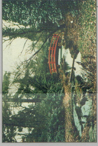
The Japanese Water Gardens, Warren Road