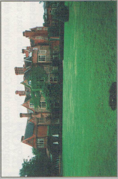
Warren House, Warren Road.