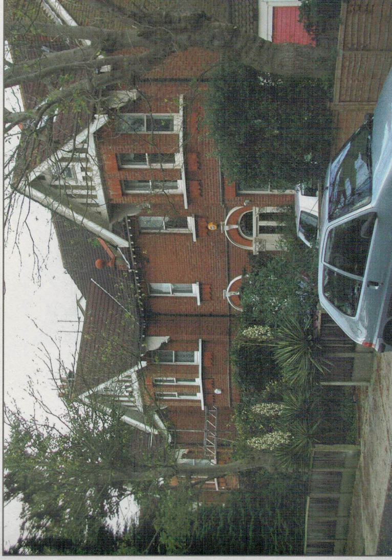
Presburg Road.