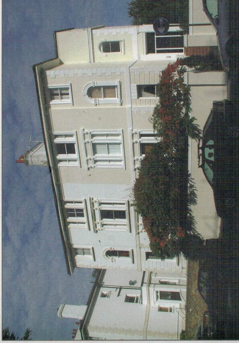
Uxbridge Road.