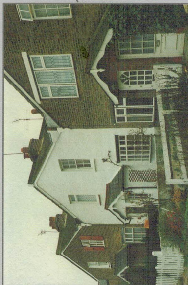
St. Leonards Square.