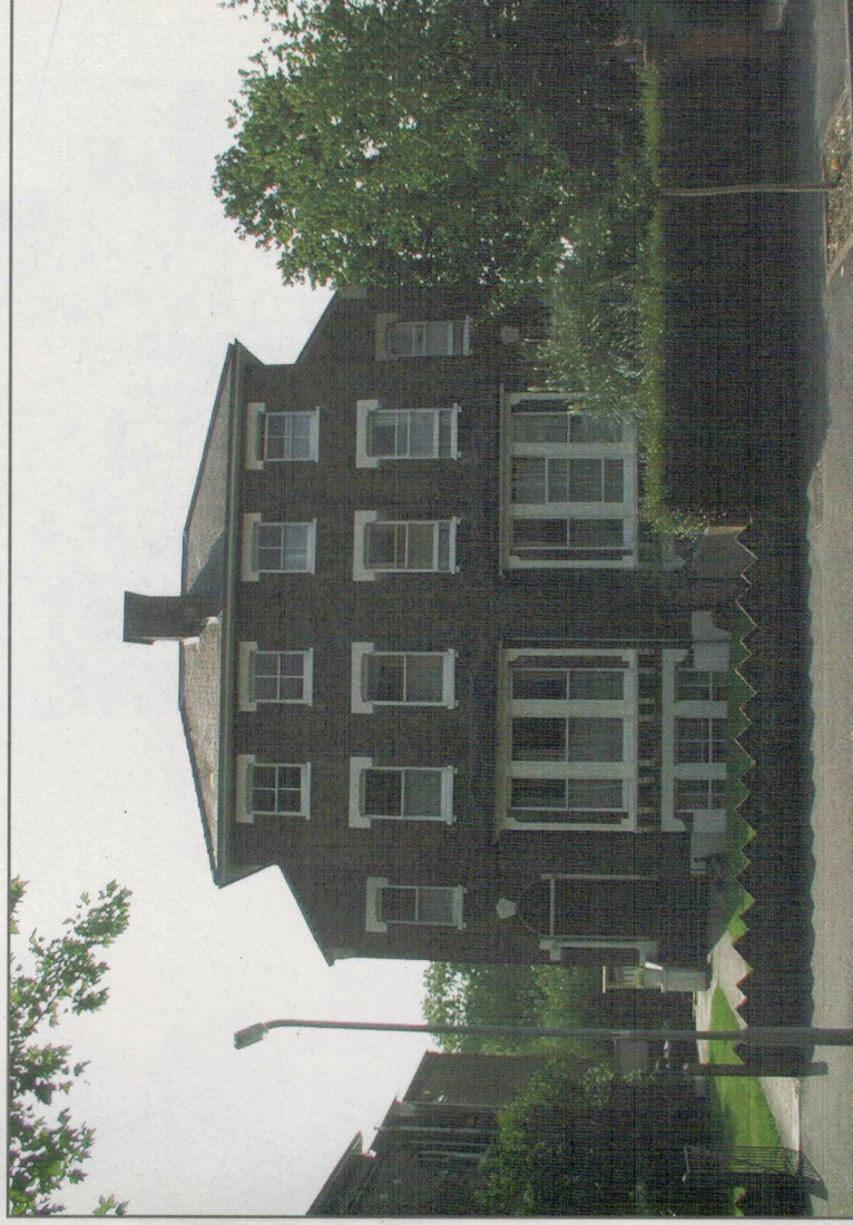
Christchurch Road