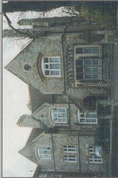
The Vicarage, Queens Road.