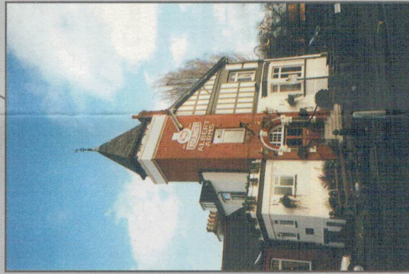
The Albert Arms, Queens