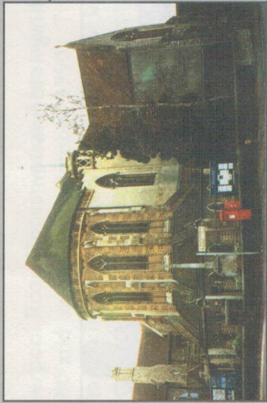
St. Pauls Church, Queens Road.