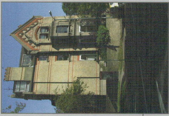
Upper Brighton Road.