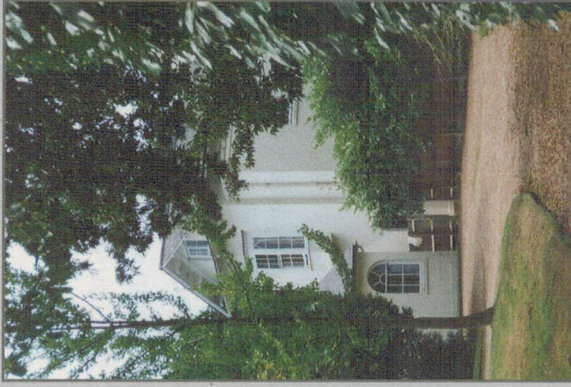
Southborough Lodge, Ashcombe Avenue.