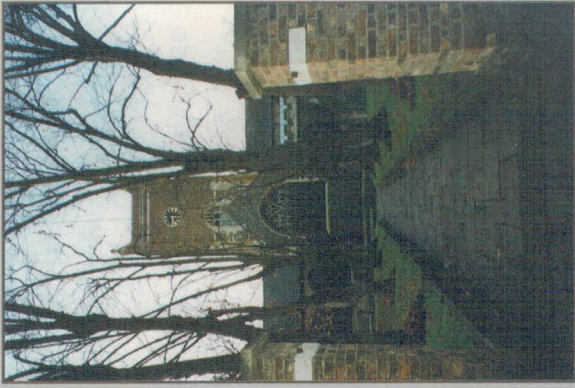
Church of All Saints.