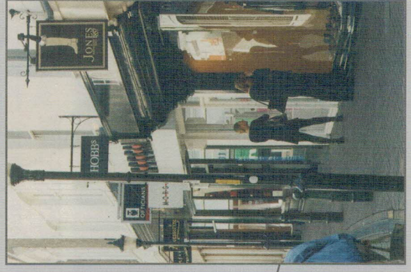
Shop signs in Church Street