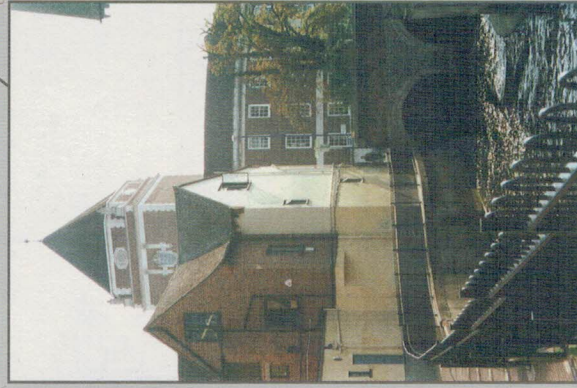
Rear of the High Street, the Clattern Bridge and the Guildhall behind.