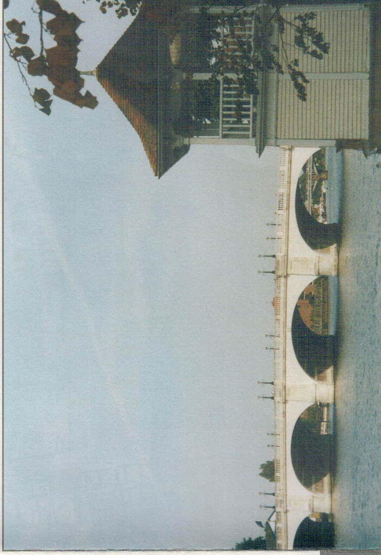
Kingston Bridge and The Gazebo, Riverside.