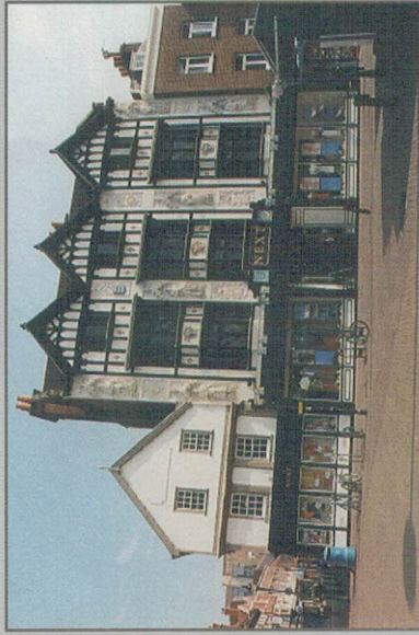
The Market Place.