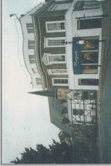
Church Street and Kingston Baptist Church.