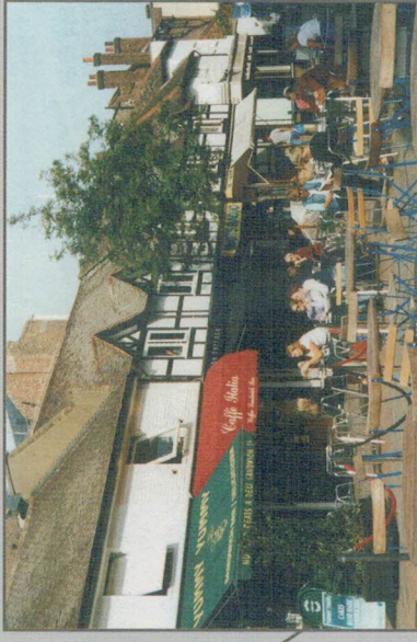
The Apple Market.