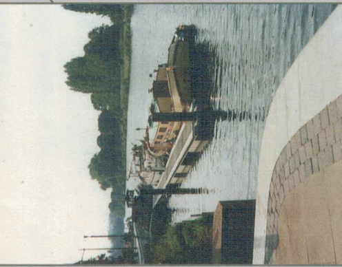
The new riverside.