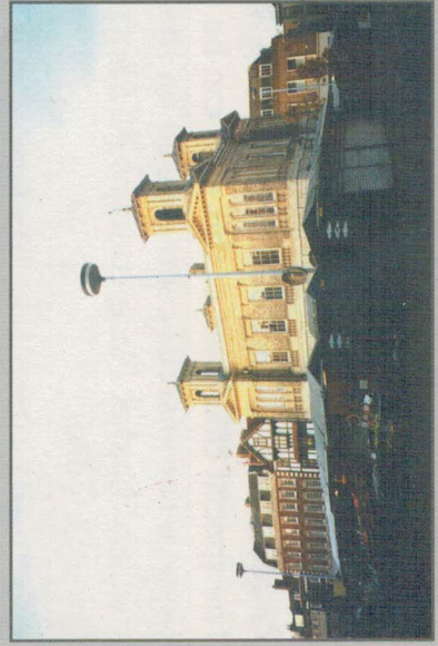
The Market House and the market place.